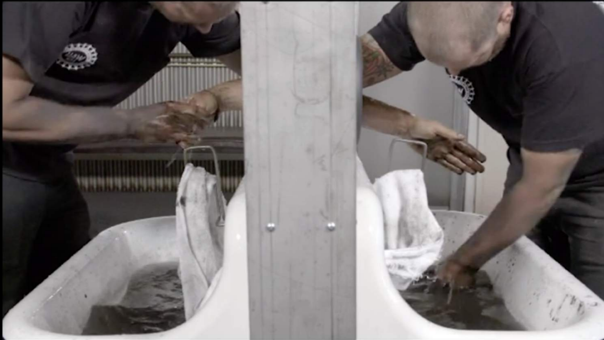
Handwash, 2016 Collaboration with Alex Gartelmann 00:02:22 Single channel video

Please follow web link: https://vimeo.com/193606164#t=01:10