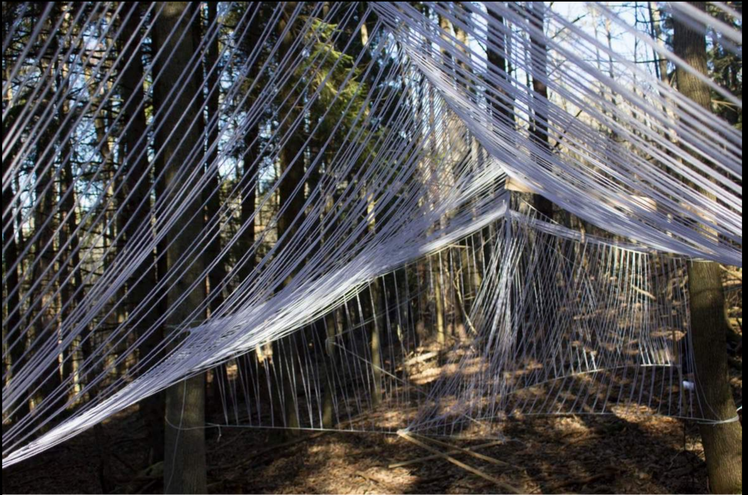
Greg Atkinson Sophomore, Intro to Sculpture Home, 2015 cotton rope, wood