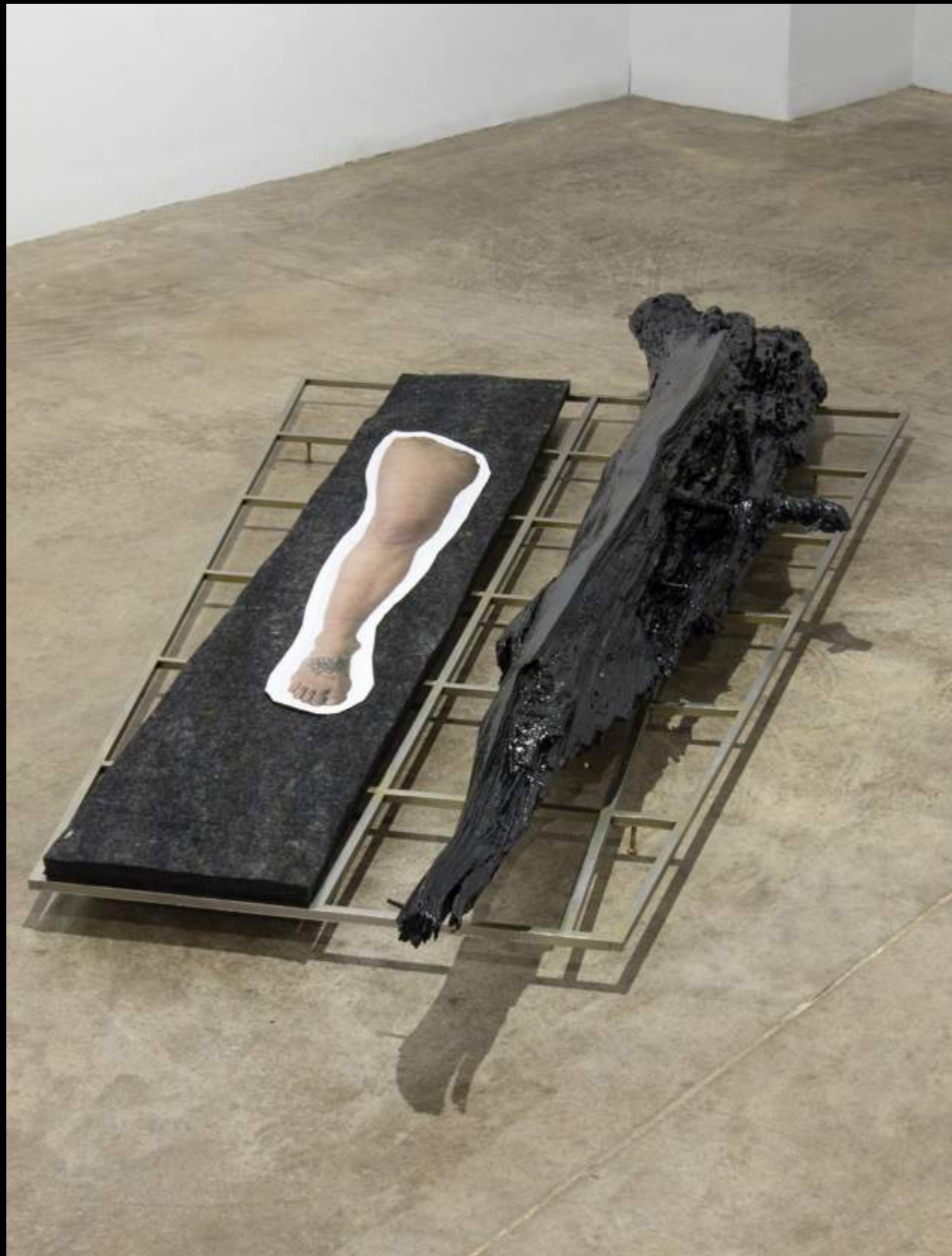
Between Us and Them 2018 Wood, resin, steel, fabric 42 x 72 x 16 in.