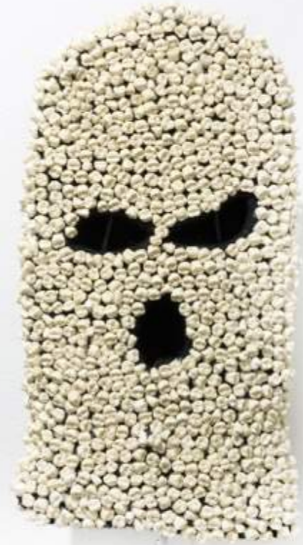
Teeth Mask (control ritual) 2017 Cast plastic, fabric 16 x 8 x 2 1/2 in.