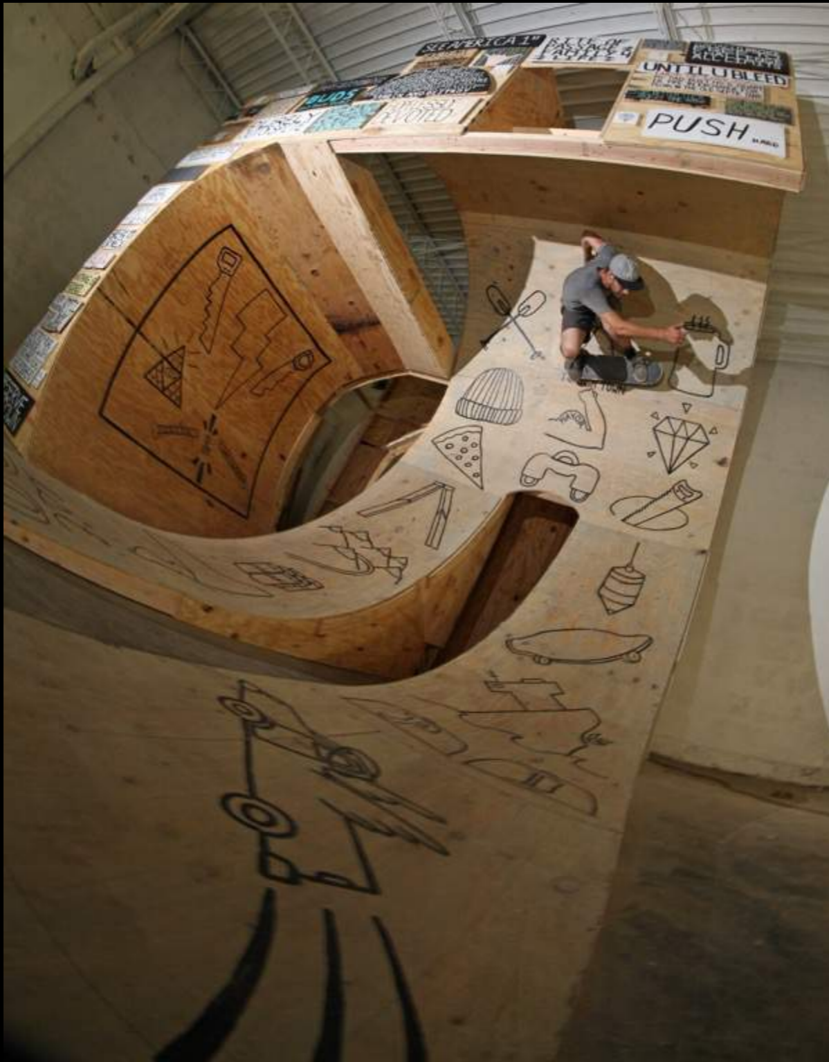
Church, 2014 Collaboration with Alex Gartelmann 12' x 12' x 12' Installation at Hufft Projects, Kansas City, MO Wood, Paint, Shoes, Steel