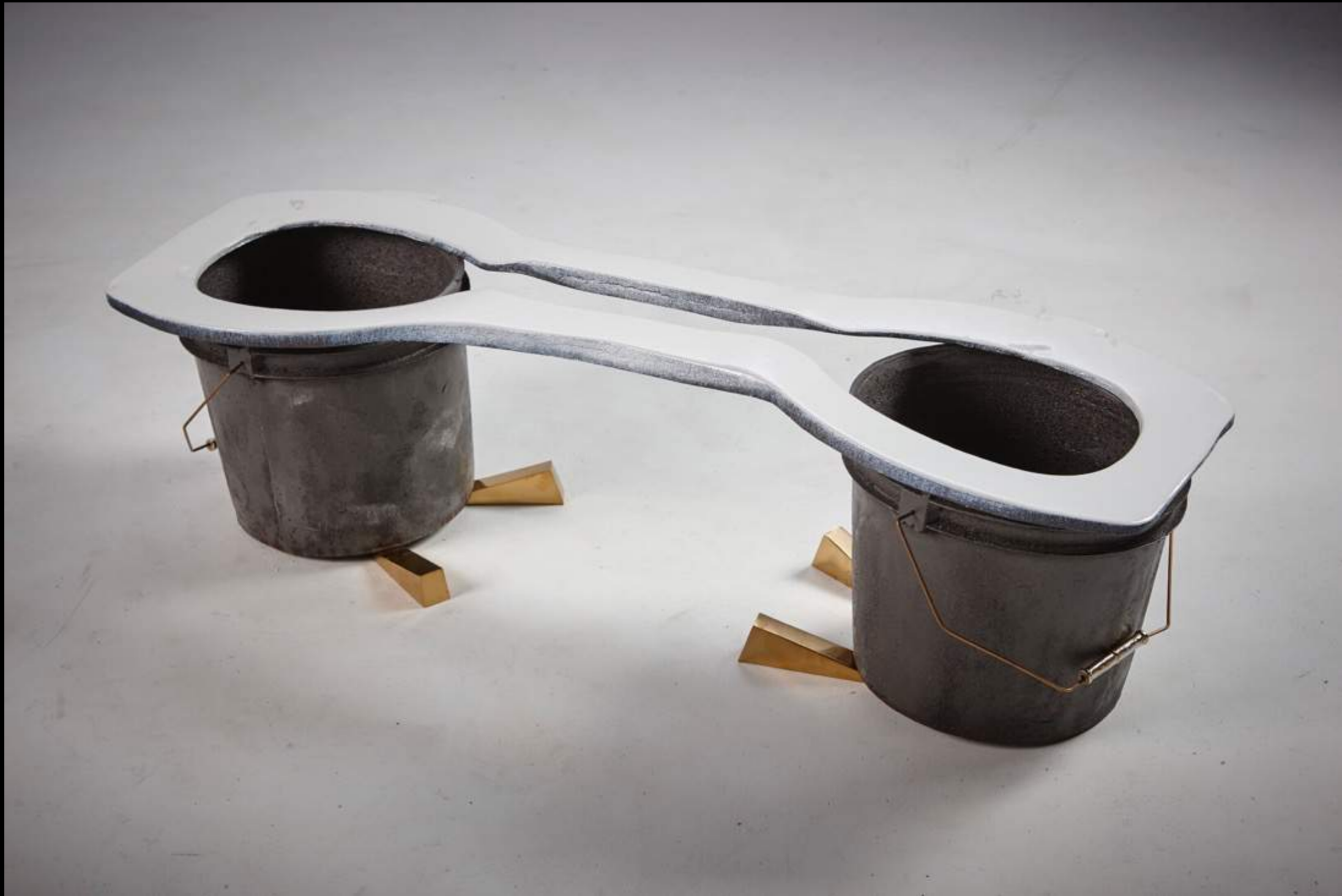
One Seater, 2016 Collaboration with Alex Gartelmann 36"x18"x16" Enamaled Iron ,cast brass