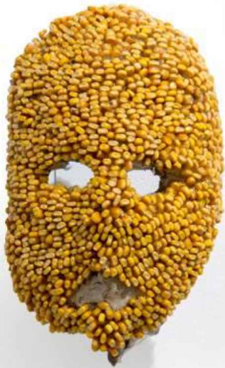
Corn husker (offering) 2018 Corn, resin, clay 12 x 6 x 4 in.