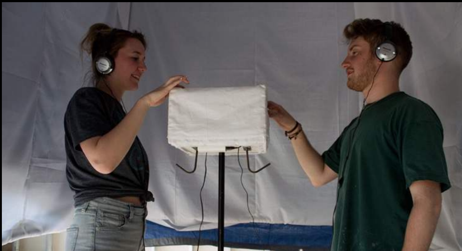
Larry Statts Senor, Installation Untitled , 2016 Tarp, dirt, arduino, lights