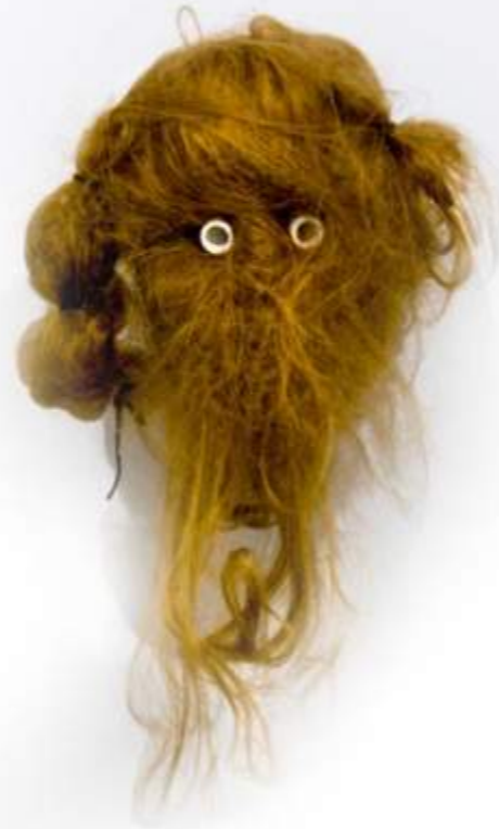
Hair Mask (for knowledge and power) 2018 Hair, resin 12 x 6 x 8 in.