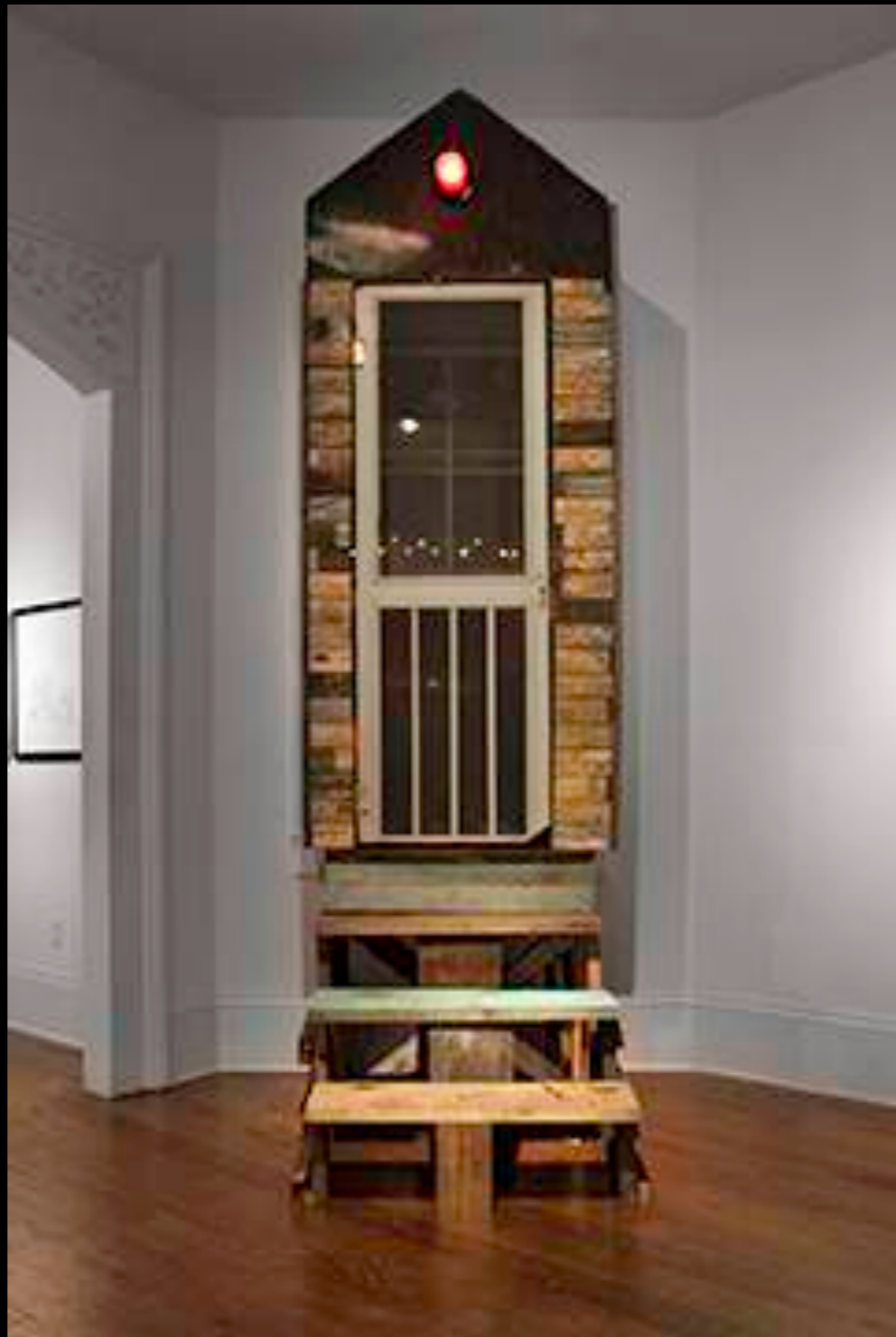
Juke Joint, 2015 Collaboration with Alex Gartelmann 10'x5'x 10' interior view @ Antenna Gallery, New Orleans Wood, metal, light, record player Fats Waller album, single pane windows tin cans, ceiling fan