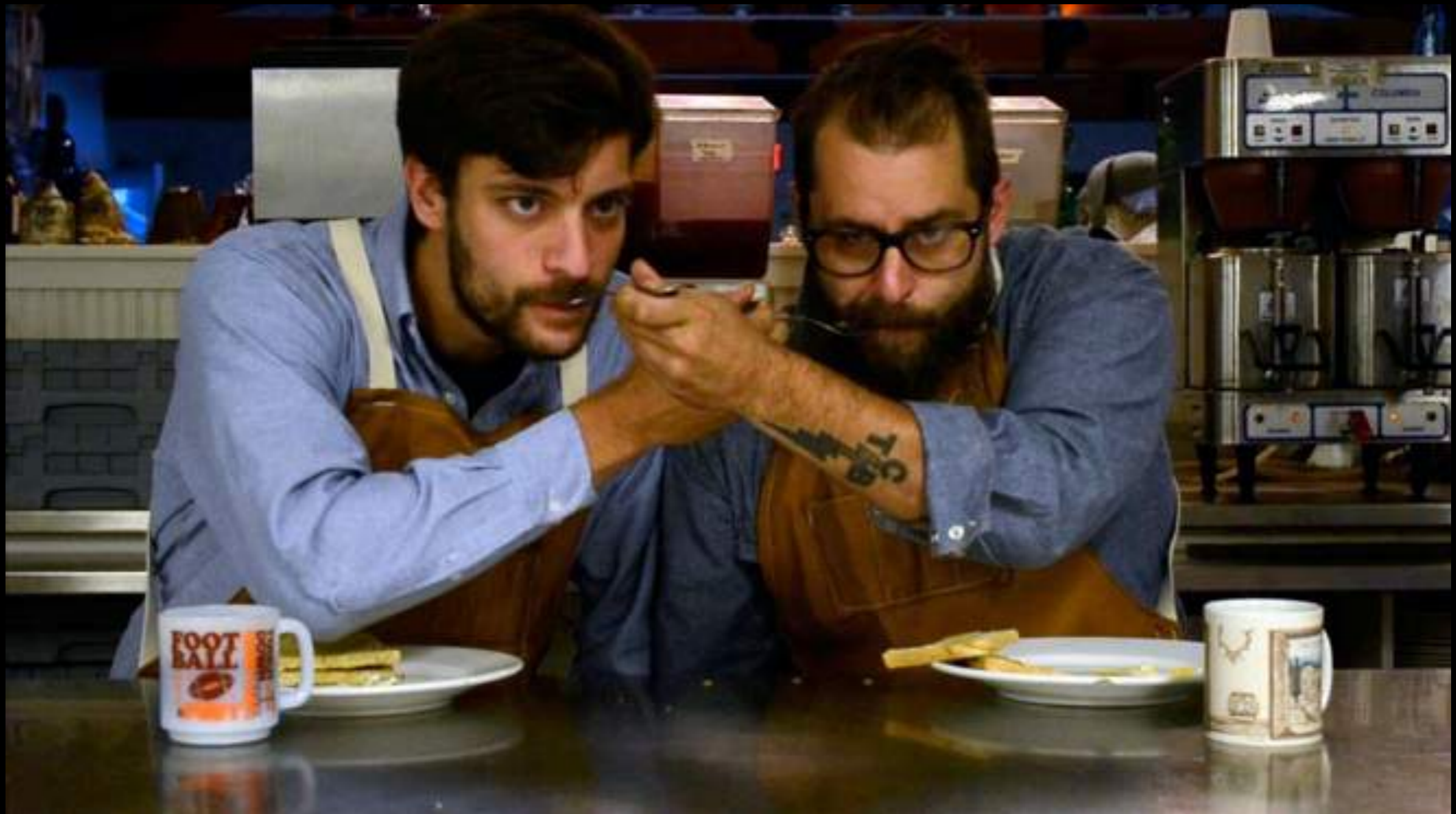
Breakfast, 2013 Collaboration Alex Gartemann 00:03:48 Single Channel Video

Please follow web link: https://vimeo.com/97608882#t=01:10