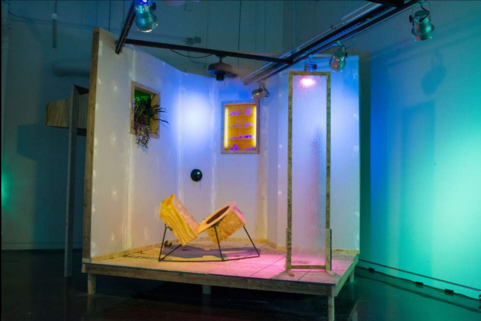
Void, 2017 96"x96"x120" Installation at The Crawford Gallery, Kent OH Wood, glass, steel, water, single channel video, plants