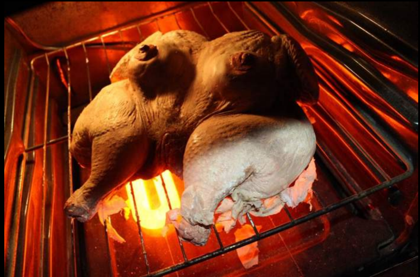
Ann Dargenio Junior, Sculpture 2 Coming out to Mom and Dad, 2017 stove, candles, fluorescent light, cast plaster