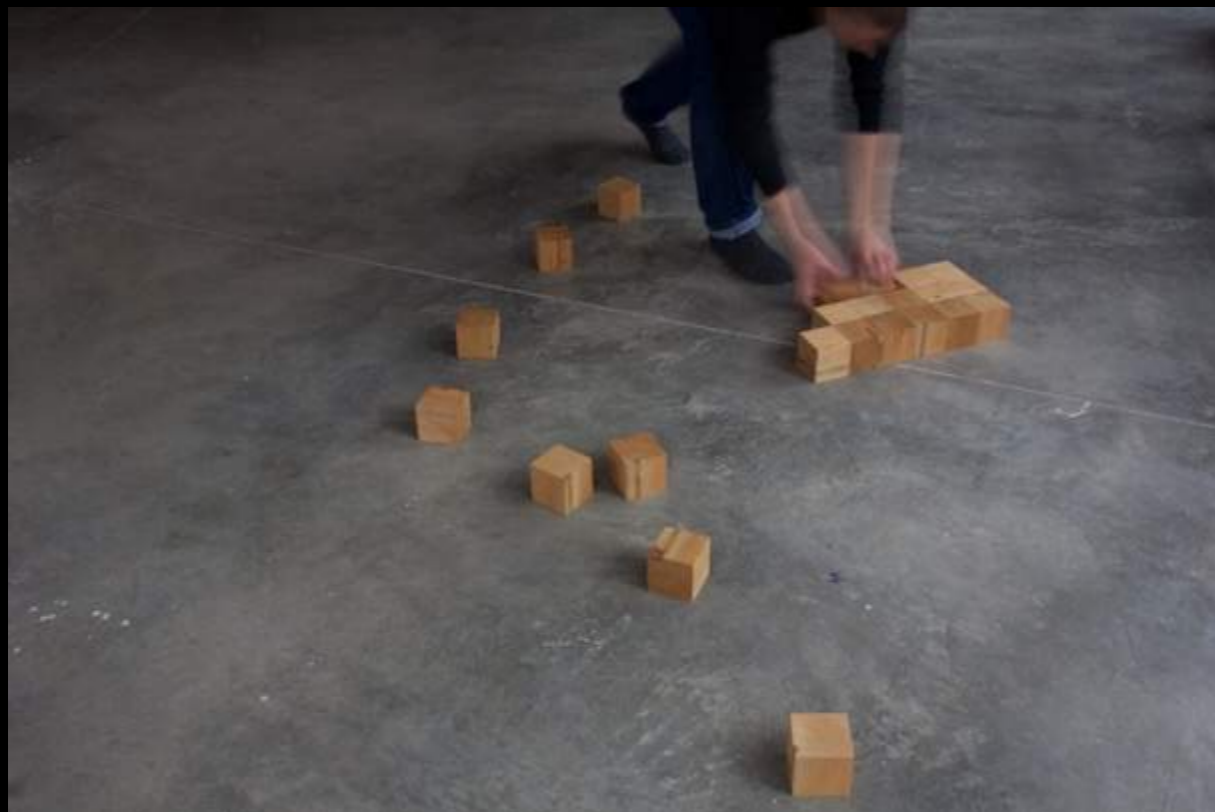
Craig Butterworth Graduate student, Graduate Projects For Carl 2012 Performance with 4x4 cedar arrangement