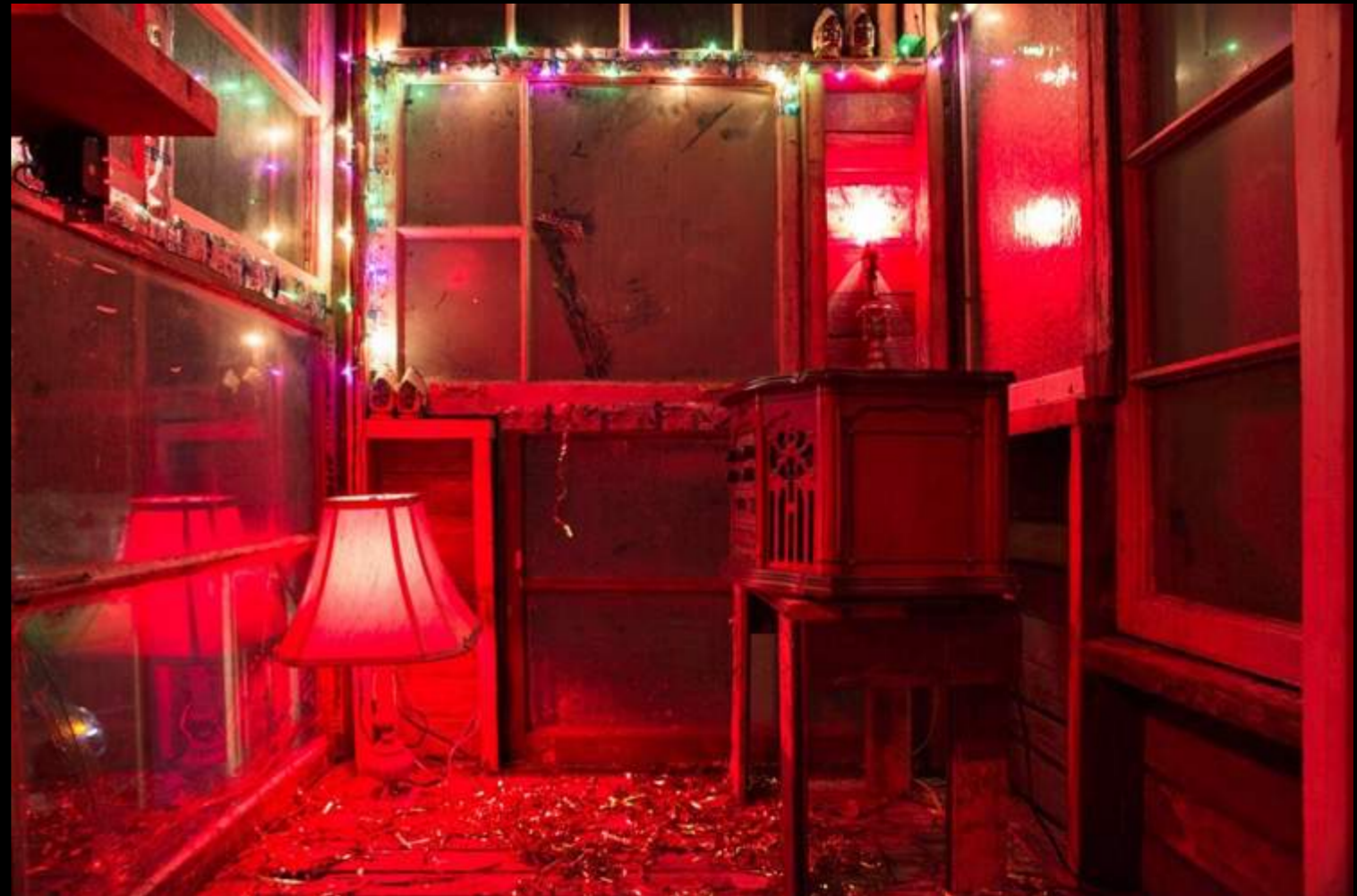
Juke Joint, 2015 Collaboration with Alex Gartelmann 10'x5'x 10' interior view @ Antenna Gallery, New Orleans Wood, metal, light, record player Fats Waller album, single pane windows tin cans, ceiling fan