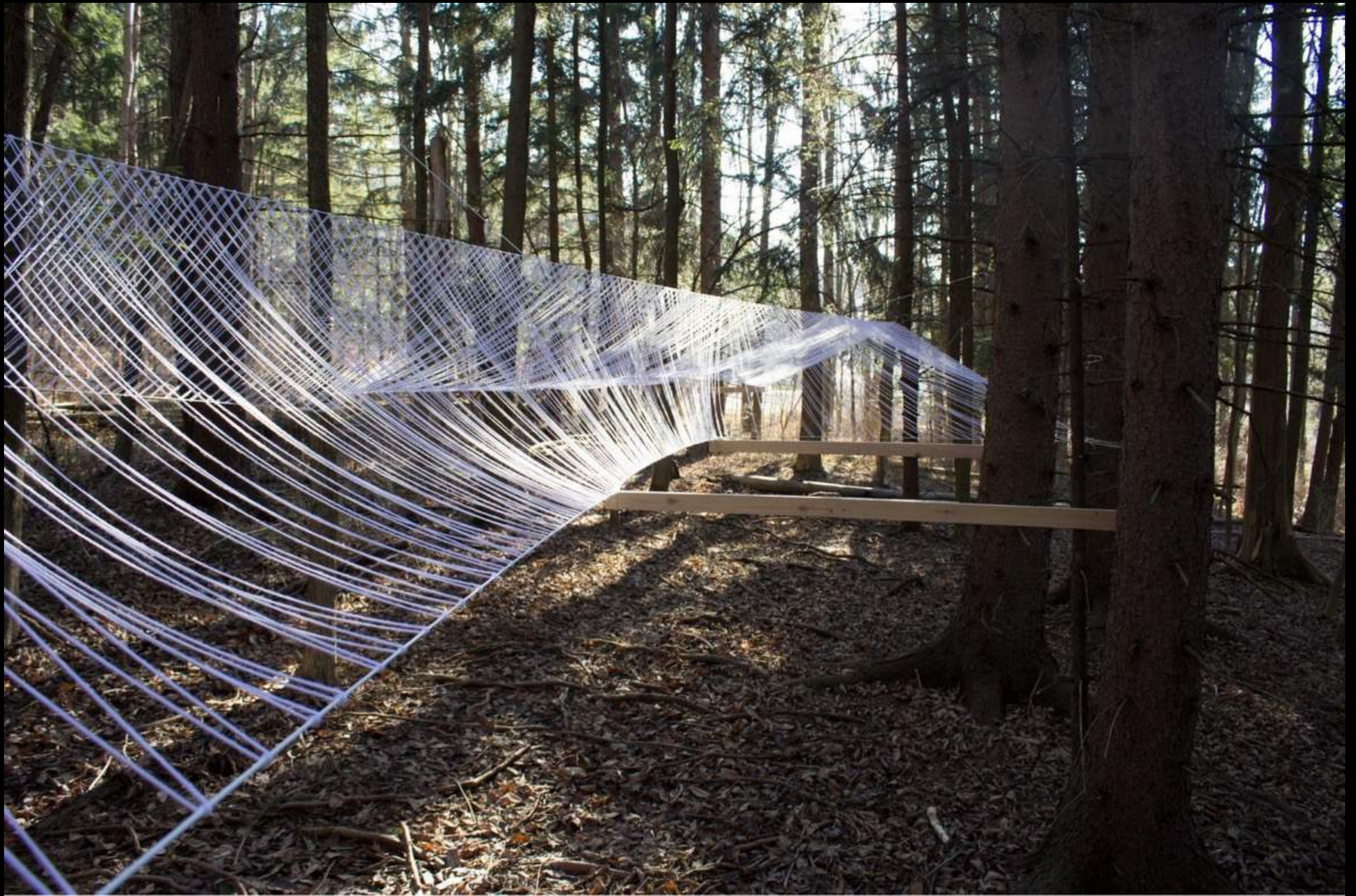
Greg Atkinson Sophomore, Intro to Sculpture Home, 2015 cotton rope, wood