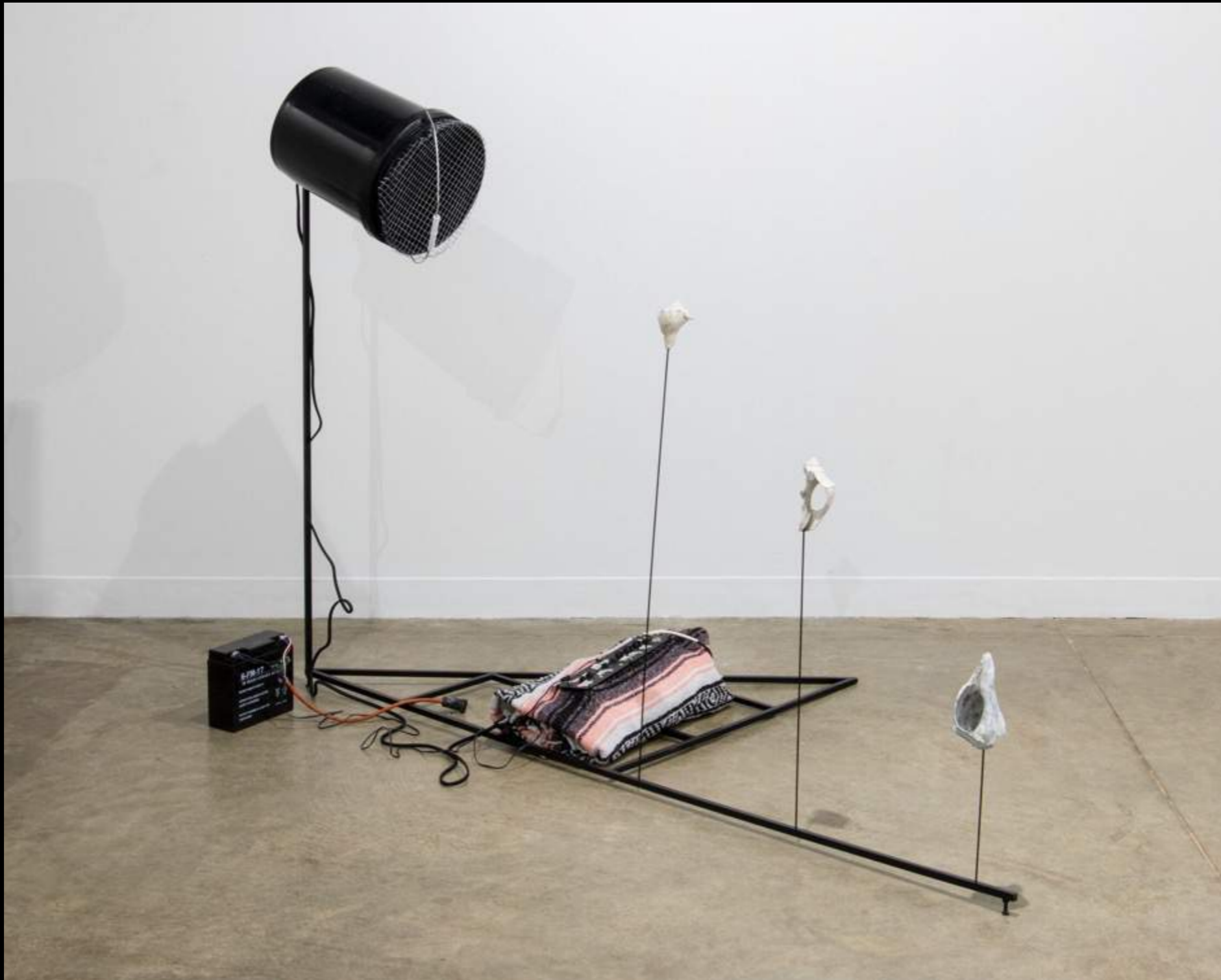
Making Do 2018 Steel, plastic, custom electronics 36 x 60 x 42 in.